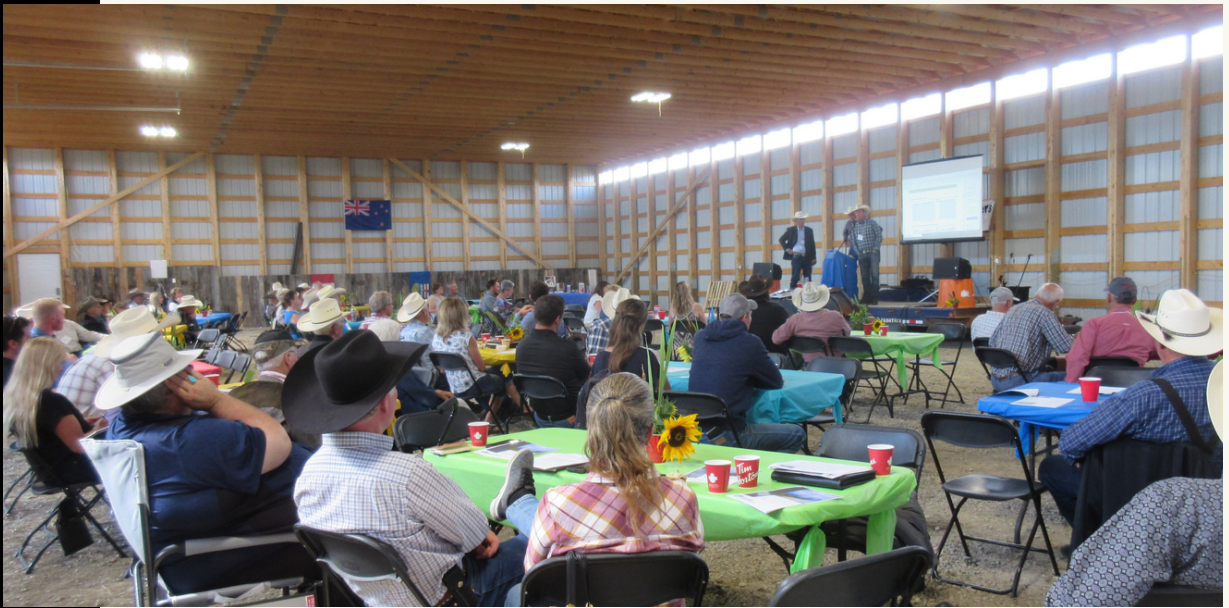
Summer Meeting 2021

Each level up from bronze adds even more value in extended reach through our Facebook and Twitter accounts and our newsletter, which is delivered to each WSGA member and is consistently the most viewed pages on our website.