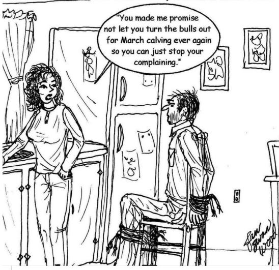
OUTTAGRASS CATTLE COMPANY